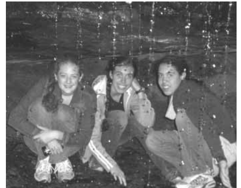
Youth enjoy scenic ventures in the Cumberland