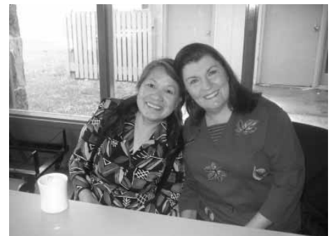
Fellowship of the Spirit