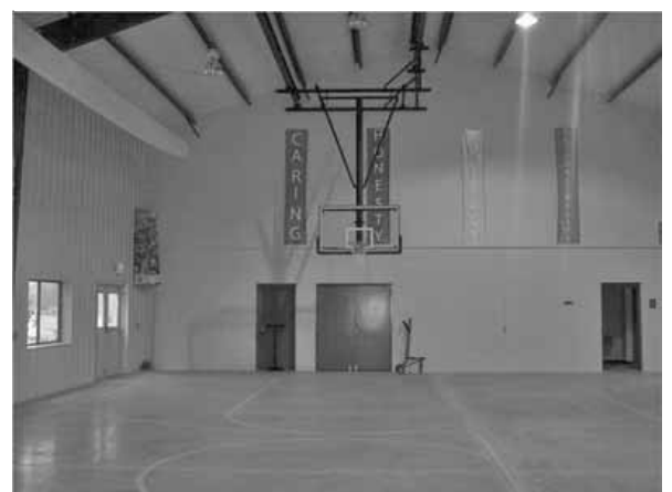
Indoor gymnasium with basketball